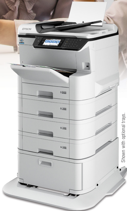
Shown with optional trays.